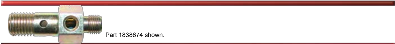
Part 1838674 shown.